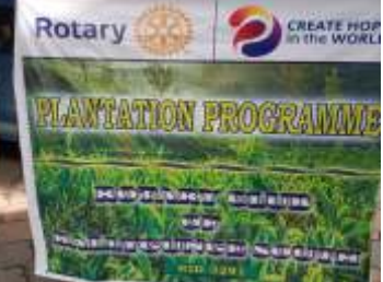
On 21st July 2023 - Tree plantation, where more than 150 sapling were distributed to the school students.